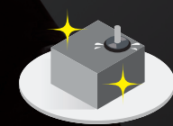
Inspection for stone polishing