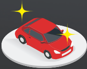
Car wash, waxing, coating