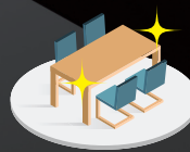
Appearance check for furnitures