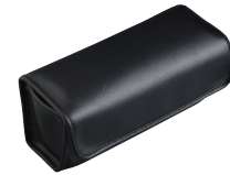
Soft case (3200829076)