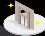
Appearance check for building materials