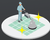
Cleaning and maintenance for buildings