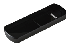
Protective cover (with integrated calibration tile, 3200840869)