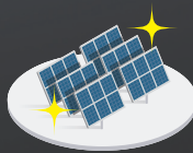
Cleaning solar panels