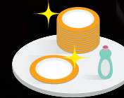
Checking cleaning performance