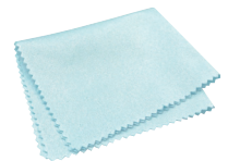
Lens cleaning cloth (3200829127)